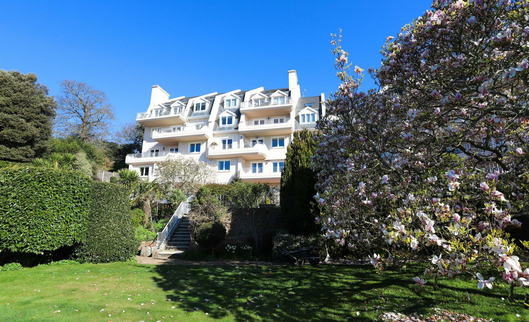
6 La Colline Court, Le Mont De Gouray, St Martin, Jersey, JE3 6UL £3,500